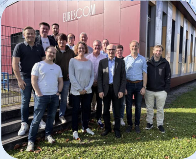
FORTRESS Kick-Off meeting in Germany, 7-8 Oct. 2025

FORTRESS is a HORIZON-CL3-2024-CS-01 project that has received funding from the European Cybersecurity Industrial, Technology and Research Competence Centre (ECCC) under the European Commission under the grant agreement number 101225722 .